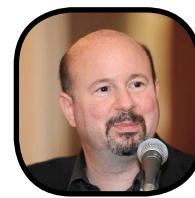
Michael Mann, Professor, will be inducted as a Fellow of the American Meteorological Society, was inducted as a

which is a collaborative symposium between the academy and the leading scientific academy of a foreign country.