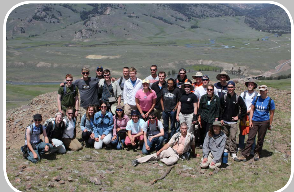
Overall, 2012 was a wonderful year with great weather, spectacular geology, and an enthusiastic group of students.