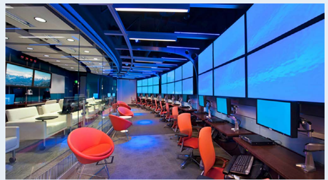
The Pulse of the Earth control room will resemble this state-of-the-art scientific visualization facility, using monitor walls and industry and research grade computer facilities.