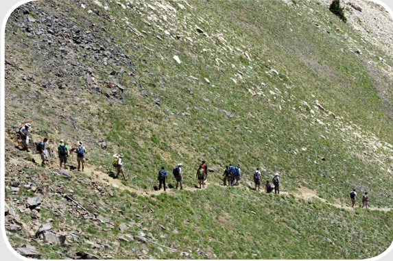
The students descend from Duff's Bench during a day of introduction to the stratigraphy of the Alta area and the mapping of ramps and flats in faulted rocks of the Sevier thrust belt.

“Field camp is so much more than a class. I was amazed at the projects we were able to accomplish each week and you and your cohort will share a unique bond created by the whole experience. It was truly the best summer I have had in college.-- Nina Bingham, 2012 Field School Participant”